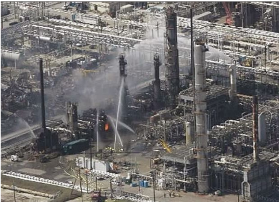
Figure 1: A fire and explosion at a refinery in Texas City, Texas, was due, in part, to an unstructured shift handover process.

A more recent incident occurred at a refinery in Texas City, Texas, on March 23, 2005. Fifteen people were killed and over 170 injured as the result of a fire and explosion in the plant's isomerization unit. The explosion occurred when a flammable vapor cloud formed following liquid overflow from the blowdown stack during operation of the raffinate splitter. Among the root causes of the accident were a failure to log pertinent information, as well as an informal and unstructured shift handover process (See Fig. 1).