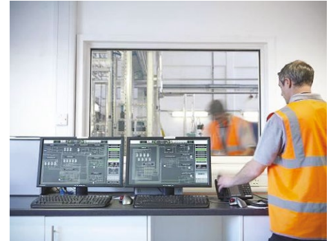
Figure 3: Some shift handover logs are no more than simple notebooks, which have obvious and serious limitations.

The requirements for an effective operations logging solution include: open connectivity with plant information systems, real-time process data reconciliation and validation, an efficient and friendly user environment, low maintenance requirements and full automation capability.