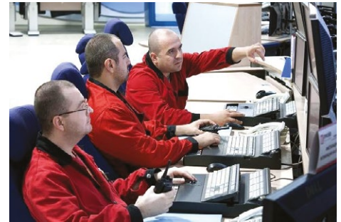
Figure 6: With a well-designed digitized logbook, operators record what they do, and everyone can see what really happened in the plant.