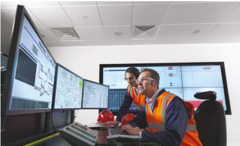
Figure 2: Operations logbooks are often a collection of disparate data and notations maintained by a supervisor or manager.

Besides content for shift handover logs, there is also context—what data should be included in daily reporting? Ideally, clear boundary lines should be drawn between different units within a plant containing several product lines.