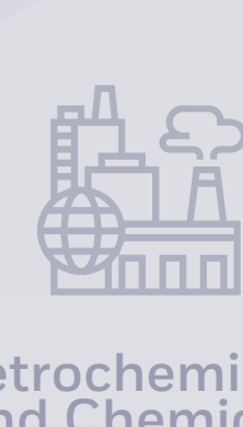
Petrochemicals and Chemicals