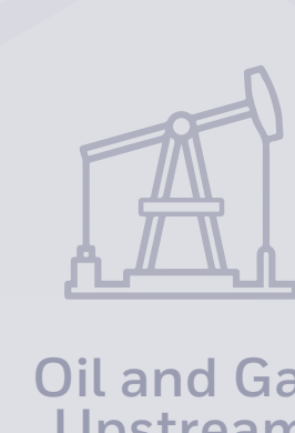
Oil and Gas Upstream