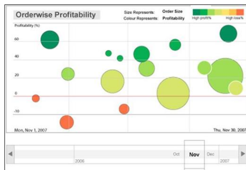
Costing Graphical Displays