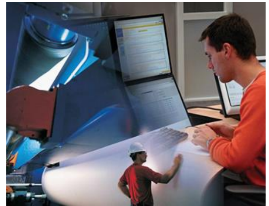
Profitability in each step of order- thro'- invoice

Complying to ISA-95 standards, OptiVision has proven itself in hundreds of installations worldwide.