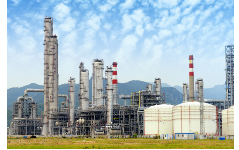
Figure 1. Veolia's Red Lion plant was able to enhance its motor control capabilities by deploying new technology with Honeywell's Remote Migration Service.

When first established as a Greenfield site, the Red Lion facility implemented a Honeywell Experion® PKS Distributed