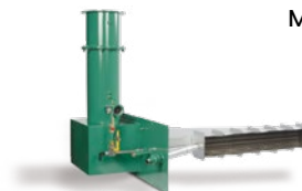
Eclipse Linnox ULE