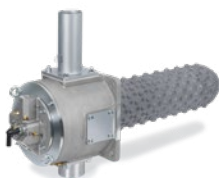
Kromschroder ECOMAX® LE