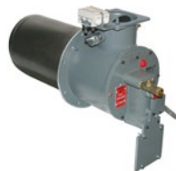
Maxon OVENPAK® LE