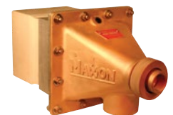
Maxon OXY-THERM® LE